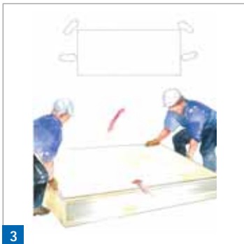
Two person Picking