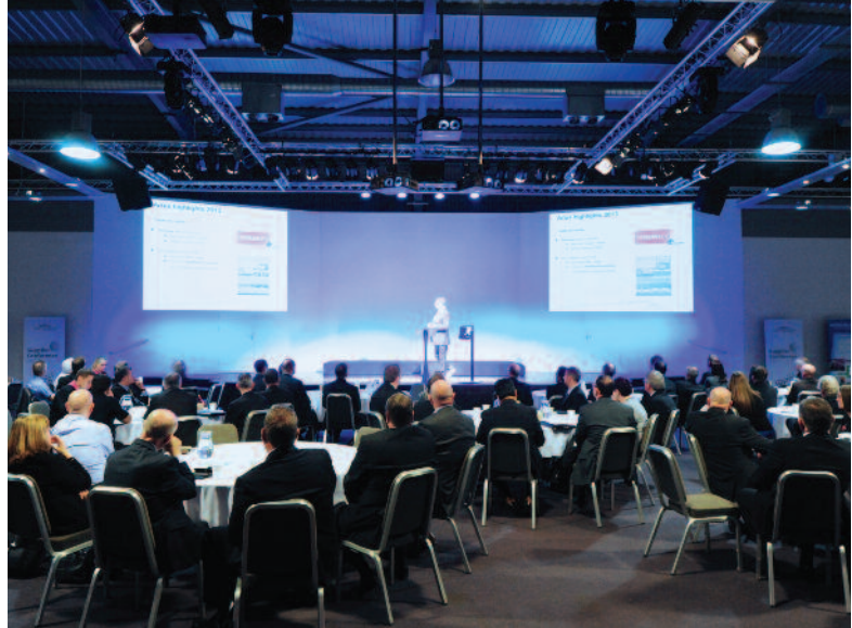
Picture above: Supplier Conference 6 th November 2013

5 Legal Compliance Commitment – Suppliers carry on their activities in strict compliance with applicable domestic and international legal standards.