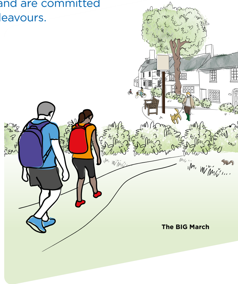
The BIG March

One notable initiative was the collective effort undertaken by our colleagues in March. During this month, employees participated in the BIG March, all in support of CRASH. Participants went on regular walks, enjoying the outdoors and the opportunity to bond with colleagues while diligently tracking their steps. This initiative not only contributed to the well-being of participants but also underscored our collective commitment to supporting CRASH's invaluable work. Colleagues also raised money through an office bake sale, a 5-a-side football tournament and a regional golf day.