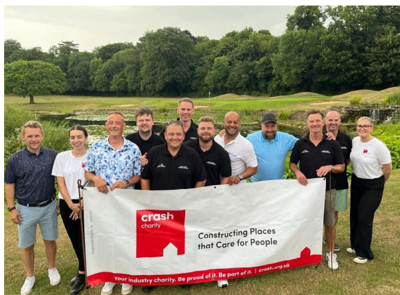
The Southwest Region Golf Day