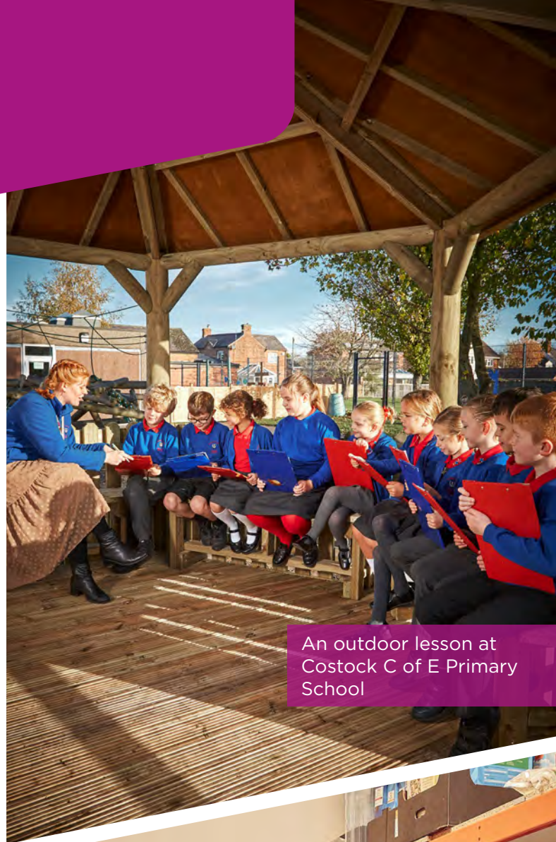
An outdoor lesson at Costock C of E Primary School