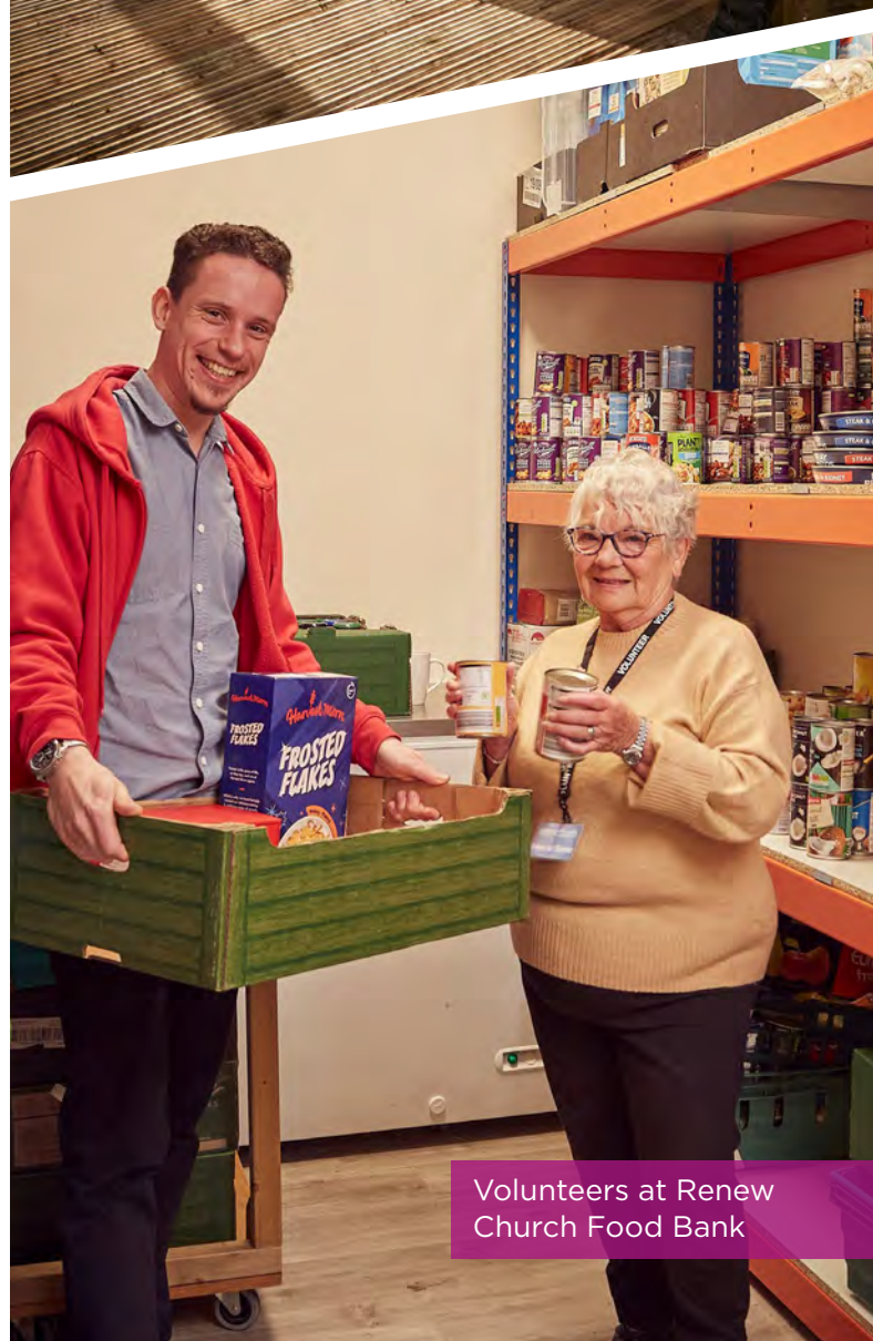
Volunteers at Renew Church Food Bank