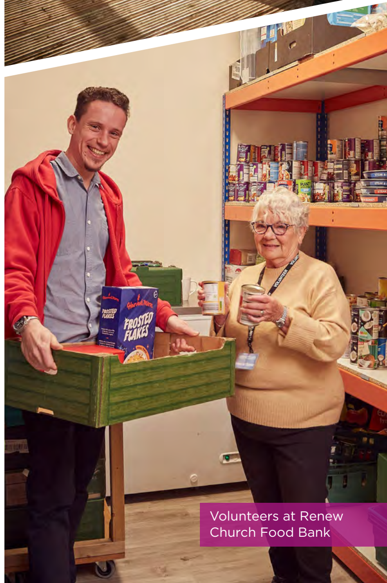
Volunteers at Renew Church Food Bank