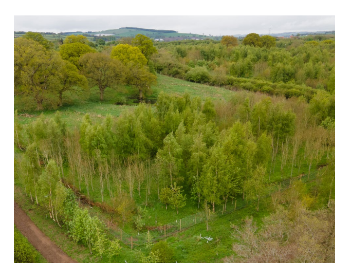
The new path helps people enjoy the Cumbrian countryside safely.

We also helped upgrade another local footpath to a bridleway and add a safe road crossing point.