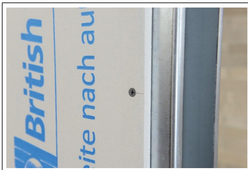
Figure 1 Glasroc X Sheathing Board and Glasroc X Screw