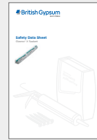
Safety Data Sheet (SDS)