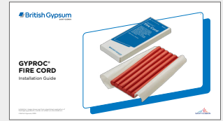
Install Guide and Video