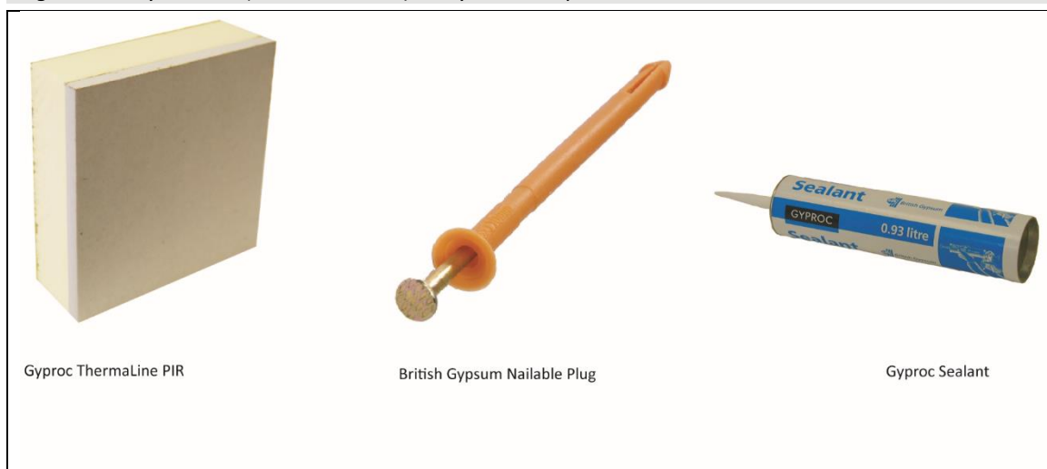
Figure 1 DriLyner DAB (Sealant Variant) — system components

1.3 The boards are available with the nominal characteristics shown in Table 1.