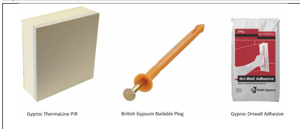
Figure 1 DriLynner DAB (Adhesive Variant) — system components

1.3 The boards are available with the nominal characteristics shown in Table 1.